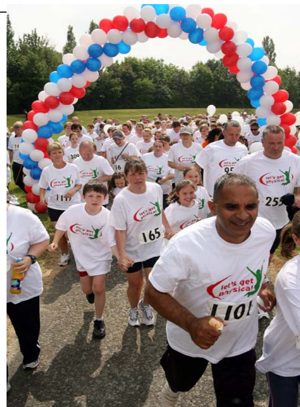
Telford – “Let’s Get Physical”