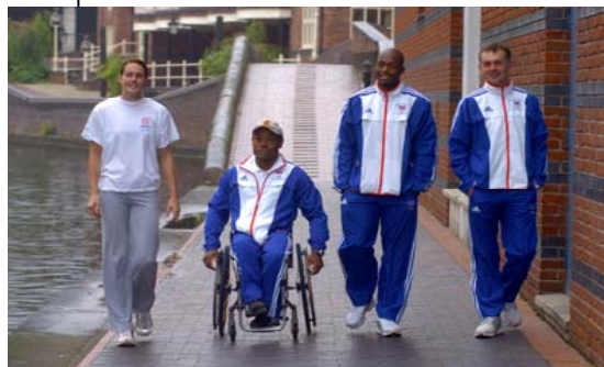
WM Olympic/Paralympic medallists