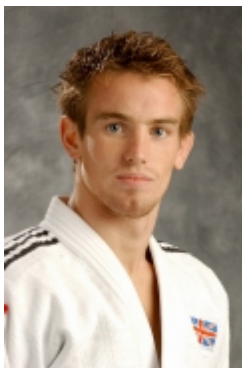
Craig Fallon Judo – World Champion Wolverhampton